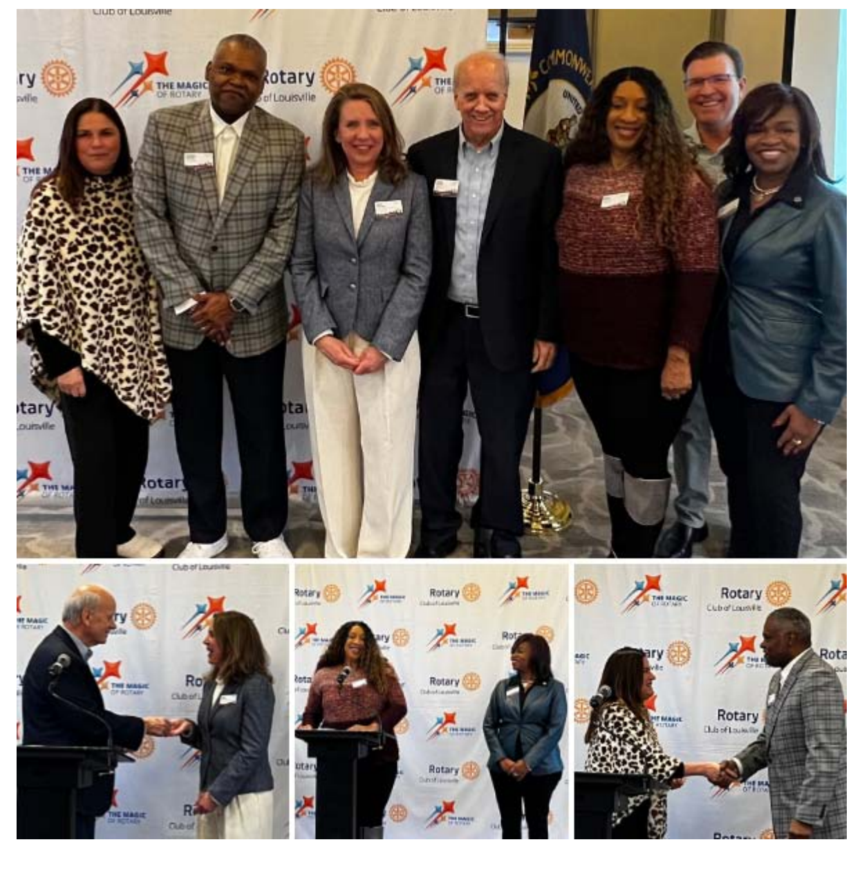
Click Read More to read their introductions: Read More